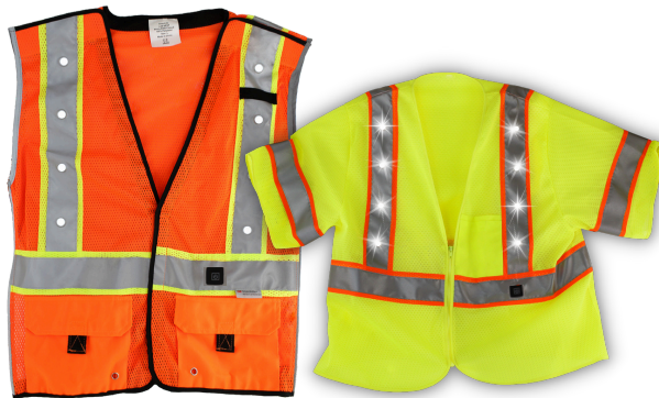
LED Vests Class 2 & 3