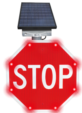
Solar LED Signs