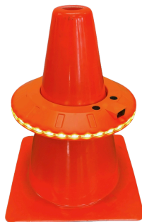
LED Cone Ring Light