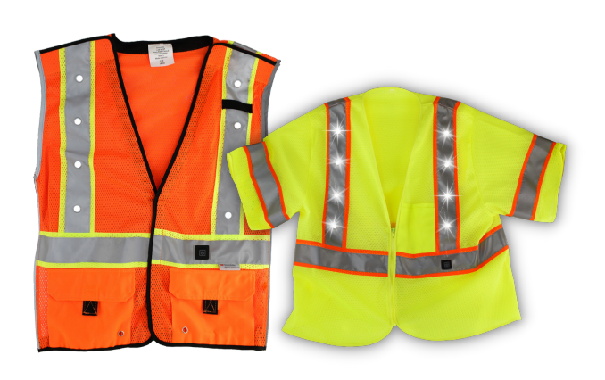
LED Vests Class 2 & 3