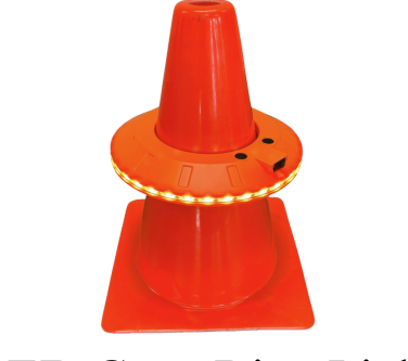
LED Cone Ring Light